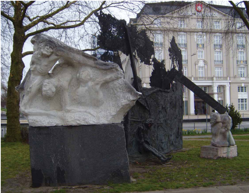
Figure 7. Alfred Hrdlicka, Memorial against War and Fascism (1985–6), Hamburg, Germany.

monuments, as well as the visitors. Its dark form sinks into the landscape rather than rising up. It encourages intimate, introspective experience rather than distant viewing. 48 Through these means, it creates a dramatic contrast to the triumphal commemorations of America's earlier wars. Following its inauguration, its perceived semantic deficiencies and formal negativities led to the installation of a political and stylistic rejoinder, Hart's 1984